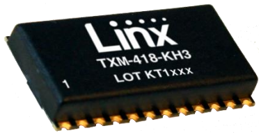
Figure 1: Original Module

The original modules were shipped with plastic lids that held the part number and helped keep the RF circuitry free of debris. The new modules will be shipped without this plastic lid. The lid served primarily cosmetic purposes so will not have any impact on performance.