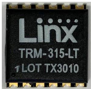
Current Product w/ Lid

The LT family of products will no longer have a plastic cap covering the module. A reflow compatible label will be used for module identification.