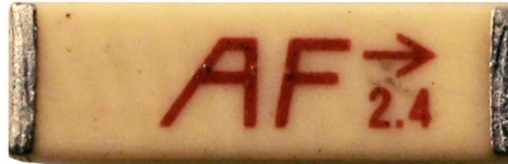
Figure 1: Form – Yellow Material