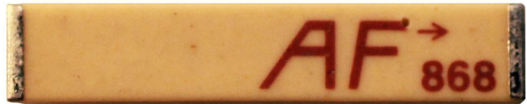
Figure 1: Form – Yellow Material